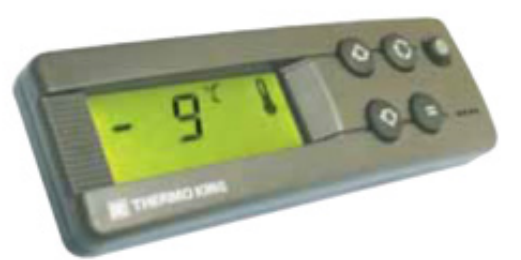
The DSR in-cab display

HMI in-cab is equipped with the most advanced features to provide best user interface experience. LCD technology allows drivers to have a comfortable exposure and outstanding display conditions. LED backlight provides an optimal view without additional light. The multiple available functions gives customers the flexibility to adapt to their specific transport application while guaranteeing optimal temperature control and product integrity. It also allows drivers to quickly identify anomalies by displaying the right alarm code symbol. DSR in-cab includes a support to provide flexibility to mount in different points inside the cabin. An optional din adaptor is also available in order to be able to position it in a radio slot.